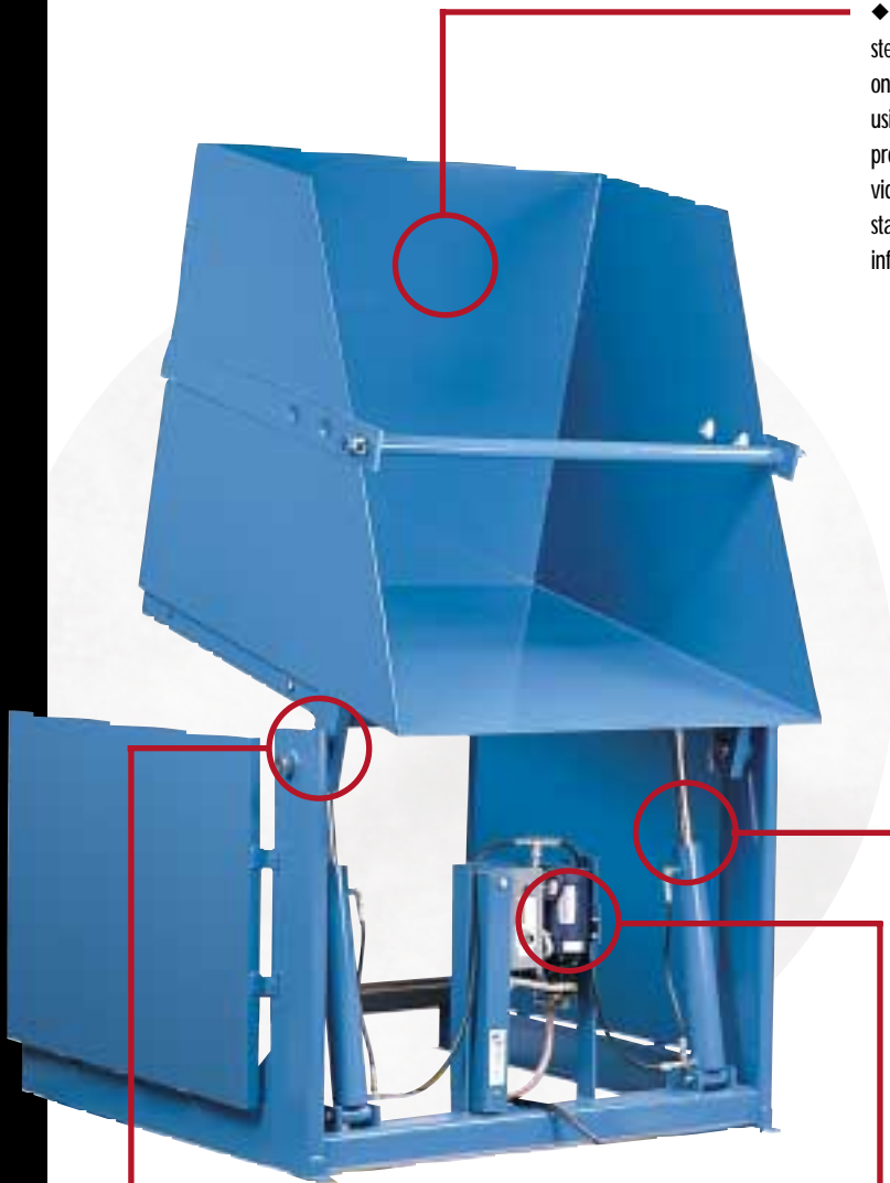
Shown without front cover panel

◆ Mechanical Advance dumpers come equipped with adjustable deflectors to direct the product flow as it is dumped. All pivot points are equipped with Teflon impregnated lifetime lubricated bearings that never need to be greased or oiled, which reduce maintenance costs and prolong equipment life. All axles and pins are made from hard chrome plated 100,000 psi stressproof steel to ensure maximum safety and prolonged equipment life.